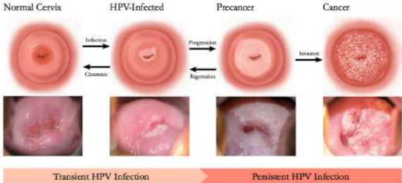
Typical timespan from HPV infection to cancer: 10-30 years

Cervical cancer can often be found early, and sometimes even prevented entirely by early screening and prevention treatment. If detected early, cervical cancer is one of the most successfully treatable cancers. Ref: Screen-and-Treat Cervical Cancer Prevention Programmes: Groesbeck Parham, MD, African Centre of Excellence for Women's Cancer Control.